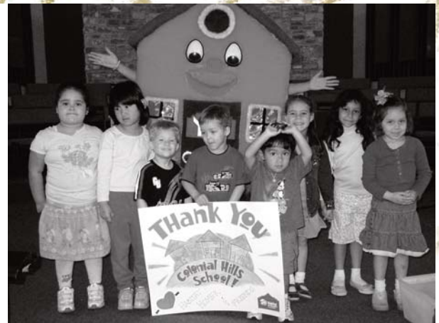
Students from Colonial Hills School and new friend Habitat Homer.

Nothing beats getting to see our littlest supporters, though. In February, I made a special trip out to Colonial Hills United Methodist School to visit the preschool through kindergarten students who raise money for HFHSA every year. With their Pennies, Nickels, Dimes and Quarters Campaign, the